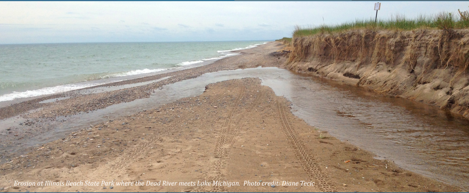
Erosion at Illinois Beach State Park where the Dead River meets Lake Michigan.