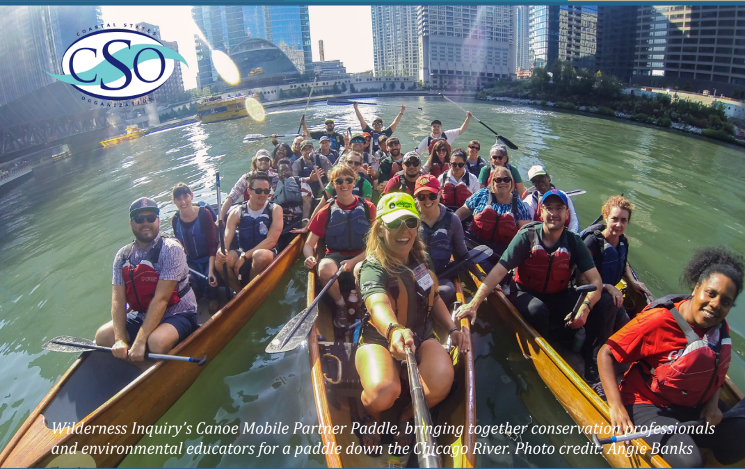
Wilderness Inquiry's Canoe Mobile Partner Paddle, bringing together conservation professionals and environmental educators for a paddle down the Chicago River.