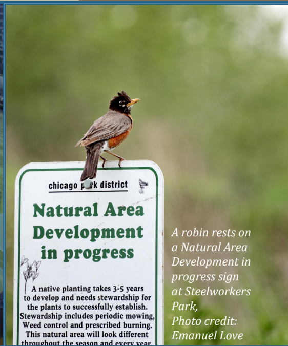
A robin rests on a Natural Area Development in progress sign at Steelworkers Park, Photo credit: Emanuel Love